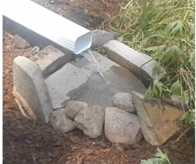
Colorado Stormwater Center

Protect your rain garden from erosion by placing rock cobbles below the inlet pipe and in areas where runoff will spill over during large storm events.