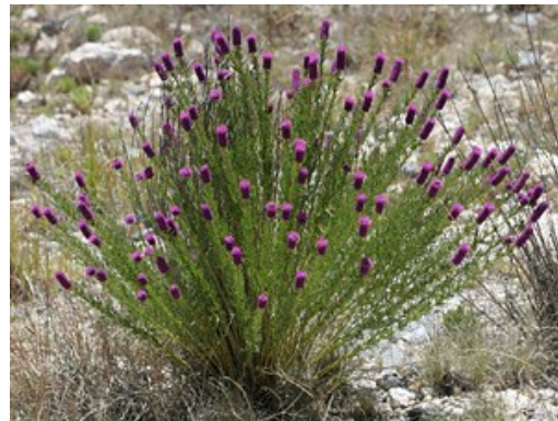
Purple prairie clover