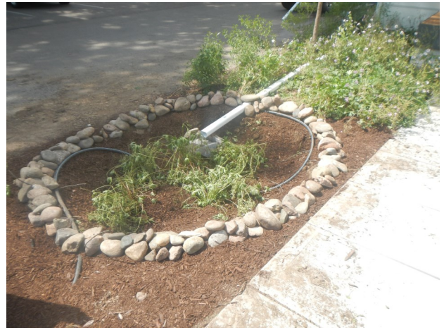
Colorado Stormwater Center