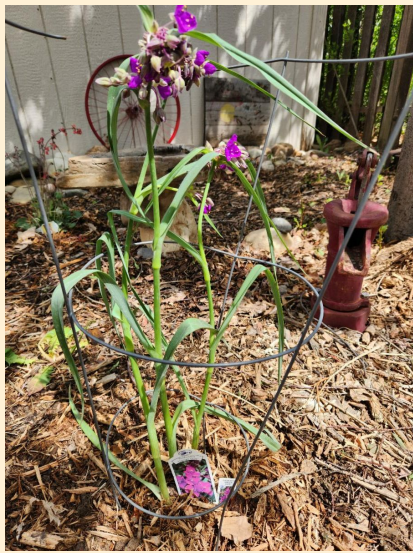
Spiderwort, Tradescantia occidentalis

I hope whatever you are tending to is thriving. Happy spring! - Alli