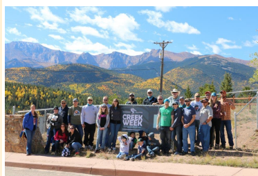
Creek Week volunteers on Pikes Peak