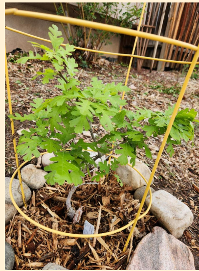
Gambel Oak, Quercus gambelii